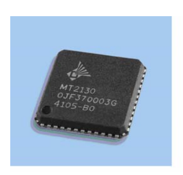
MT2130 Single-Chip Tuner

The MT2130 is a single-chip low-power tuner for analog and digital worldwide television standards.